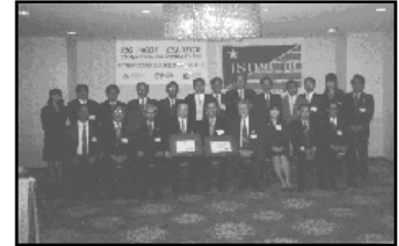
Chukyo Coca-Cola (now part of Coca-Cola Central Japan Co., Ltd) is proud to accept congratulations for their ISO 9000 and ISO 14001 Certifications.

This is an excellent vehicle to publicize your company and gain full advantage of your newly achieved status as a registered firm. PJR can arrange to have your certificate, plaque and flag presented to top management at a special Awards Ceremony and picture-taking session. The Awards Ceremony is included at no extra charge.